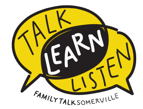
Families who talk together, learn together.