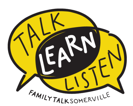
Families who talk together, learn together.