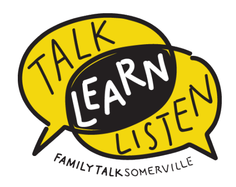
Families who talk together, learn together.