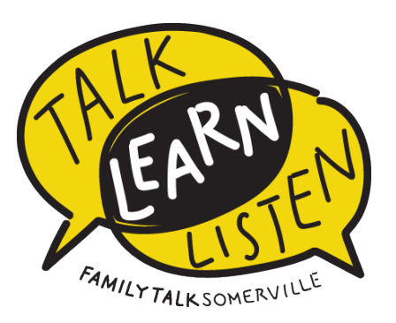
Families who talk together, learn together.