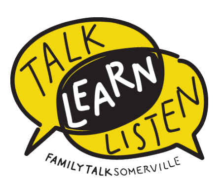
Families who talk together, learn together.