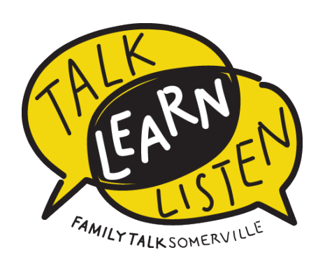
Families who talk together, learn together.